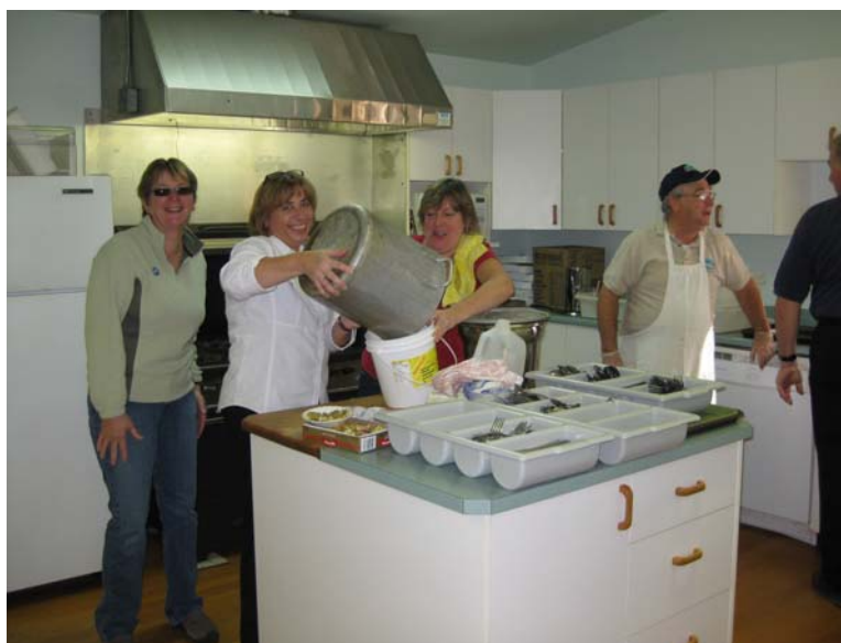
Ormstown Fair Lunch , Curling Club

In closing, we wish to thank the Ormstown Fair for the warm welcome. And thank you to those who completed the evaluation form of the congress.